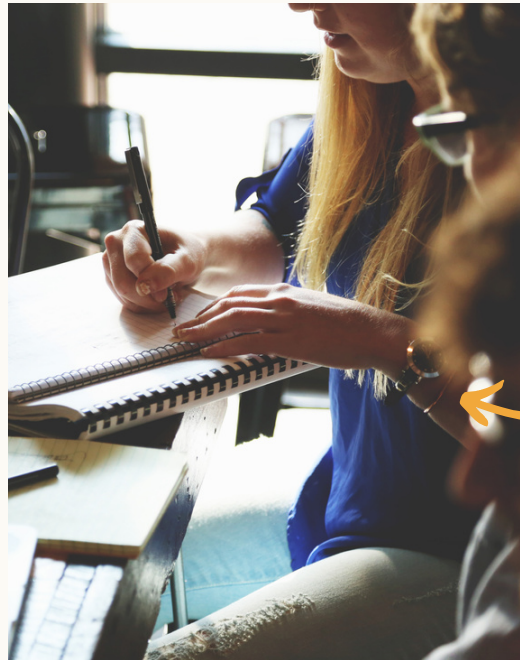
Personal Clarity Mapping