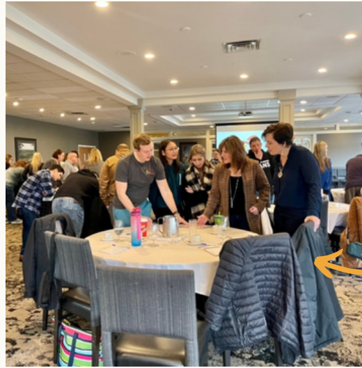
Company Clarity Mapping